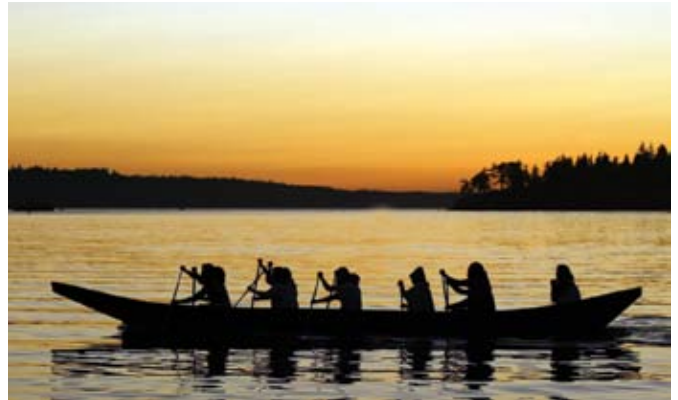
A traditional Native American canoe on Tulalip Bay near Marysville, Washington