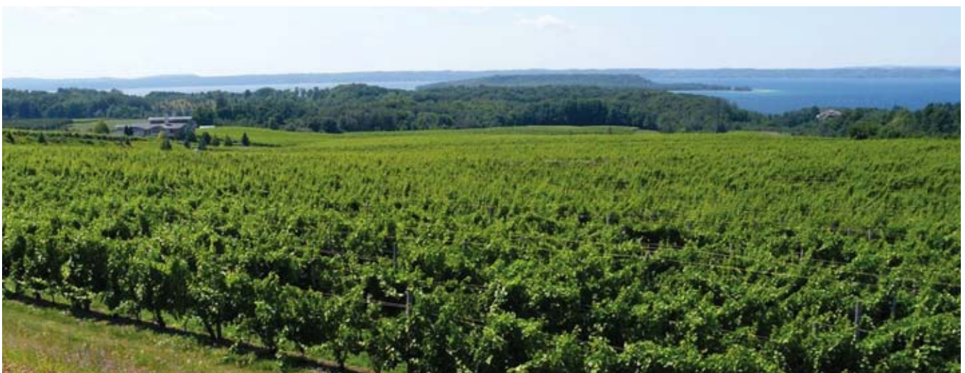
A view of Lake Michigan’s Grand Traverse Bay from protected land growing Riesling grapes at Chateau Grand Traverse winery