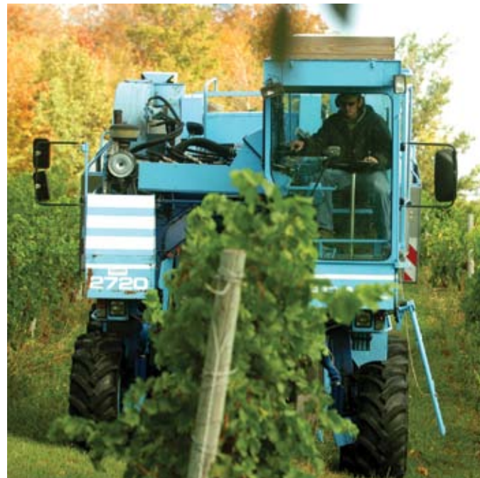
A grape harvester in a Pinot gris vineyard on Michigan’s Old Mission Peninsula

“One of the benefits we’ve seen is a really vibrant, stable agricultural community,” says Bourdages. The increase in capital available to farmers from the program has allowed them to make investments in higher value